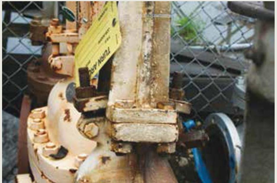
Image 2. An example of a valve that should be replaced.

This is an extreme example, but any of these conditions make part replacement necessary. A valve may have to be replaced because it was not designed for emission service. The packing loading is typically high, and valve parts could be overstressed and deformed. A high-quality emission valve will withstand